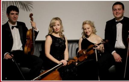
Arensky String Quartet