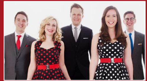
Apollo5 vocal ensemble